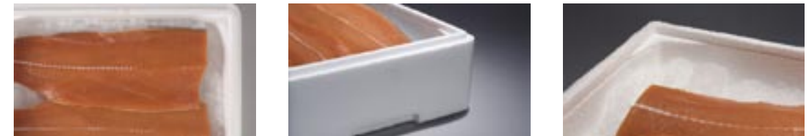
Whether packaging a printer or a fish fillet, lightweight yet durable molded foam efficiently gets the job done.

Our products consistently meet all health and hygiene regulations and impart absolutely no odor or taste. Whether eating or drinking from a foam container or using our foam to package consumer goods, you and your customers will experience only the pure untarnished nature of the product, not the packaging.