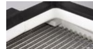
Molded foam lowers the weight and improves the efficiency of this automotive air conditioner.