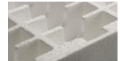
From material handling trays to computer end-caps, molded foam packaging gives you an exact 3-dimensional form fit.