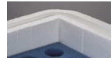
Molded and fabricated foams have been helping to improve the quality of people's lives for over 50 years.